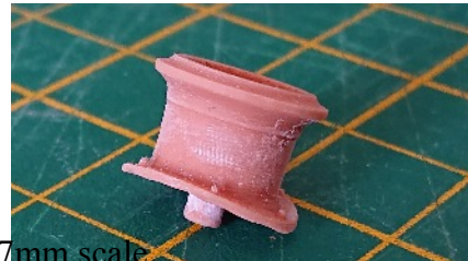
J39 Chimney, 7mm scale

Chimeys Corridor Connectors Torpedo Vents Roofs to any profile Carriage Sides and ends